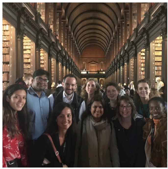
Atlantic Fellows for Equity in Brain Health