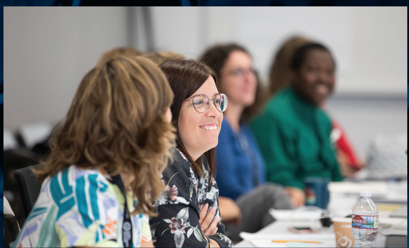
Atlantic Fellows for Equity in Brain Health

GBHI brings together a powerful mix of disciplines, professions, backgrounds, skill sets, perspectives, and approaches to develop new solutions. We strive to improve brain health for populations across the world, reaching into local communities and across our global network. We focus on working compassionately with people in vulnerable and underserved populations to improve outcomes and promote dignity for all.